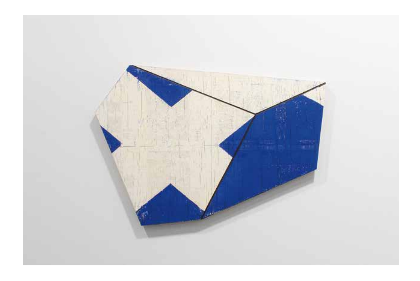
Reflex 2, 2018 Oil on Panel 16 x 23 inches