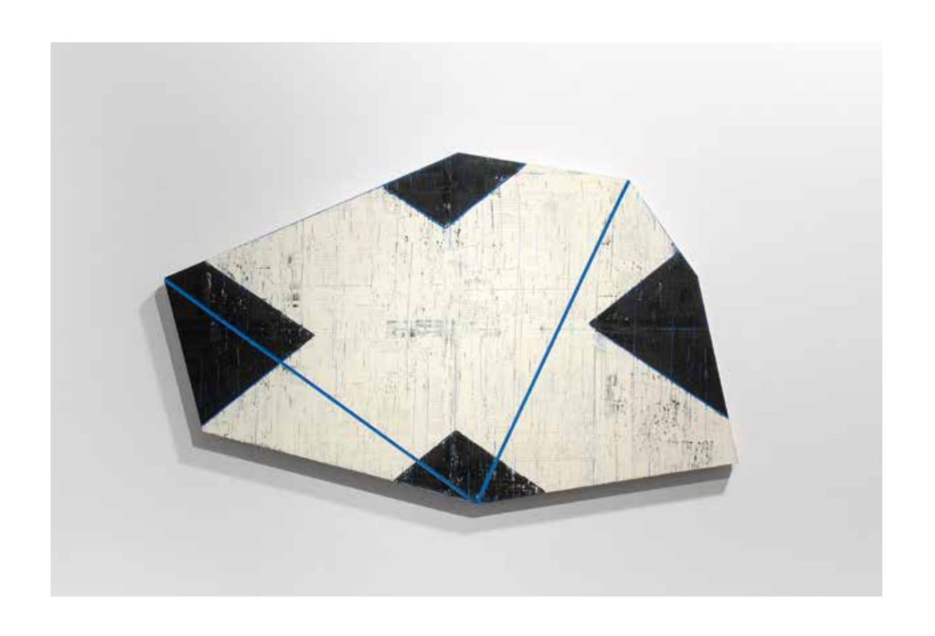
Warp, 2018 Oil on Panel 15 <sup>1</sup>/<sub>2</sub> x 26 inches