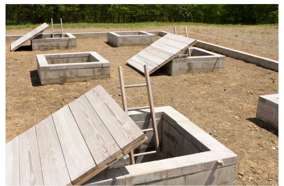
Alice Aycock: A Simple Network of Underground Wells and Tunnels, 2012, concrete block, wood, earth, approx. 28' wide x 50' long x 9' deep, Far Hills, New Jersey.

Opening Reception May 31<sup>st</sup> 6-8 PM Exhibition runs through June 27th